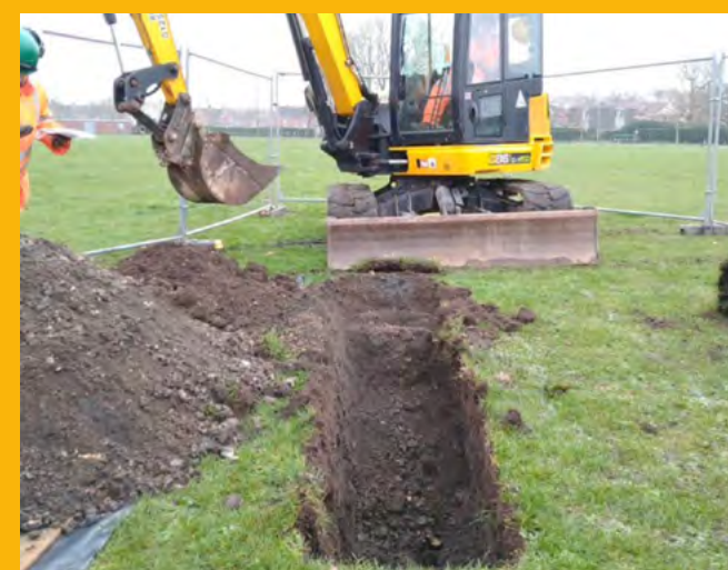
Example of trial pit on site