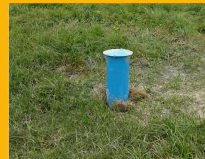
Examples of raised borehole cover