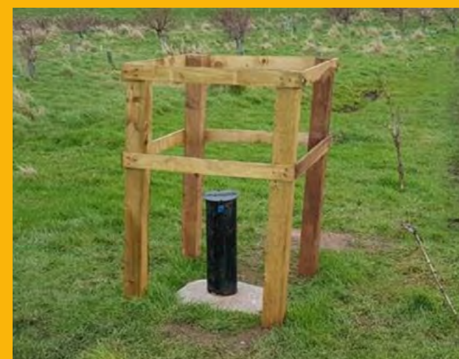
Example of raised borehole cover with marker posts