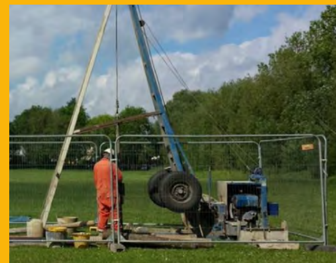
Example of Cable Percussion on site