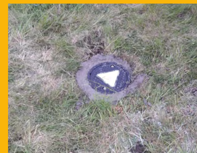
Example of a flush borehole cover