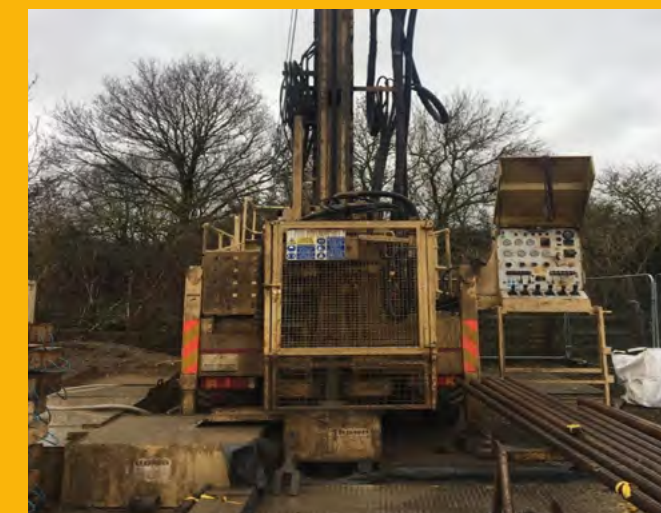
Example of a rotary core rig