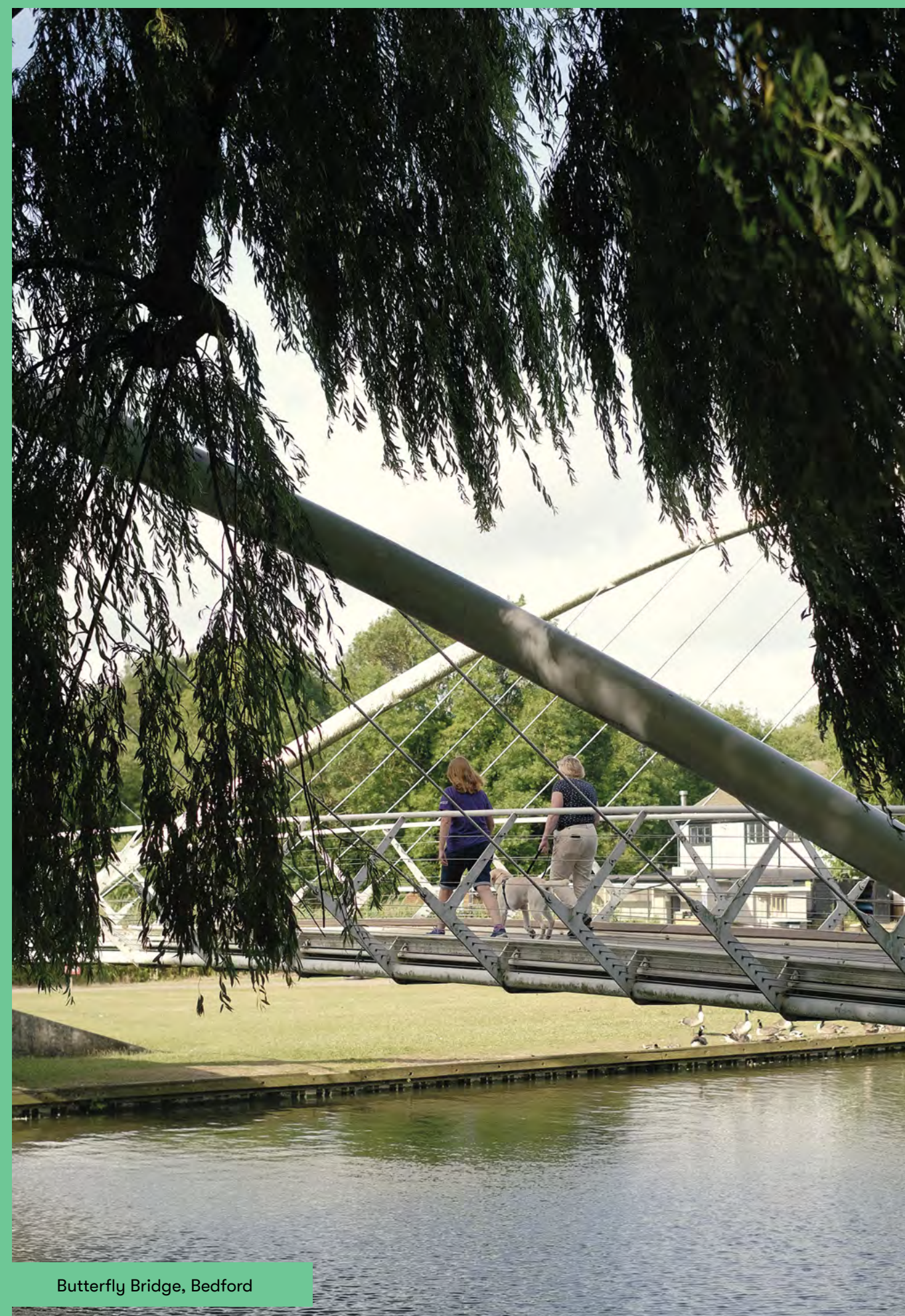
Butterfly Bridge, Bedford

Anyone employed or contracted by EWR will carry a signed letter authorising them to undertake work on behalf of EWR Co, which they will be happy to produce if you ask them.